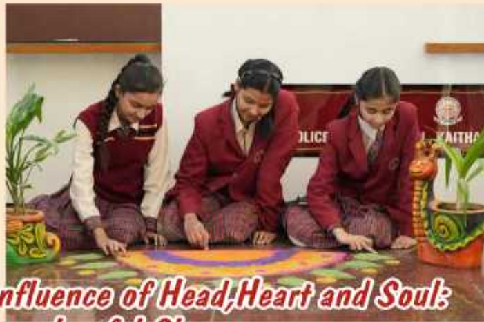
Confluence of Head, Heart and Soul: The colourful Classroom